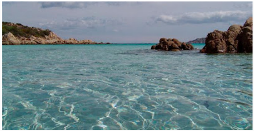
Porto Rotondo, Sardinia, Italy

The watch is powered by the trusty automatic ETA 2824-2 movement. The trident tips on the hands hark back to the main inspiration for the brand, that of the sea and Poseidon. There is just one small splash of colour on the dial; the red Porto Rotondo signature which adds an elegant touch.